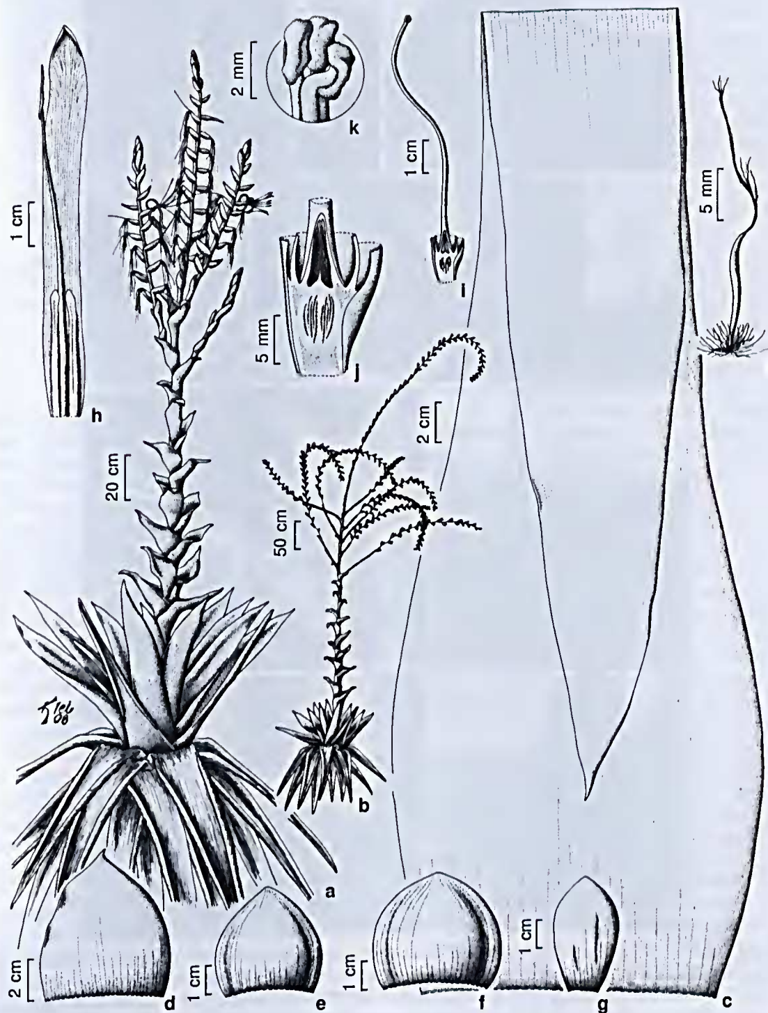
Figure 2 – Alcantarea trepida – a. habit at anthesis; b. habit at fructification; c. leaf; d. peduncle bract; e. primary bract; f. floral bract; g. sepal; h. petal; i. pistil; j. ovary; k. stigma; l. seed. (a, c-j Versieux 396; b, l Versieux 394).